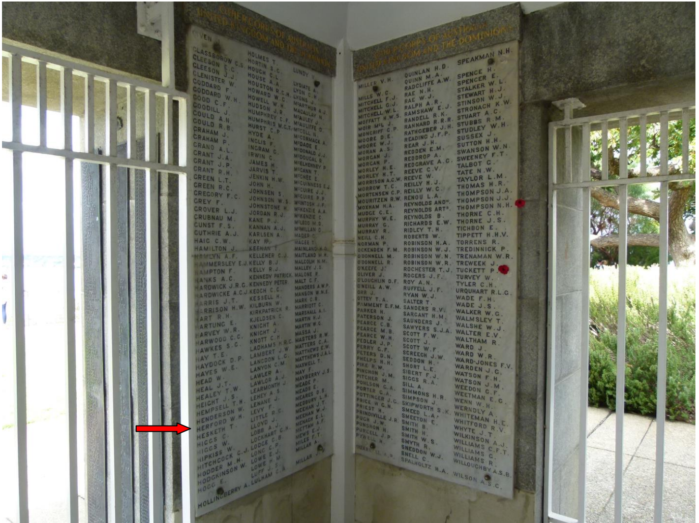
Other Corps of Australia Panel at Western Australia State War Memorial Crypt