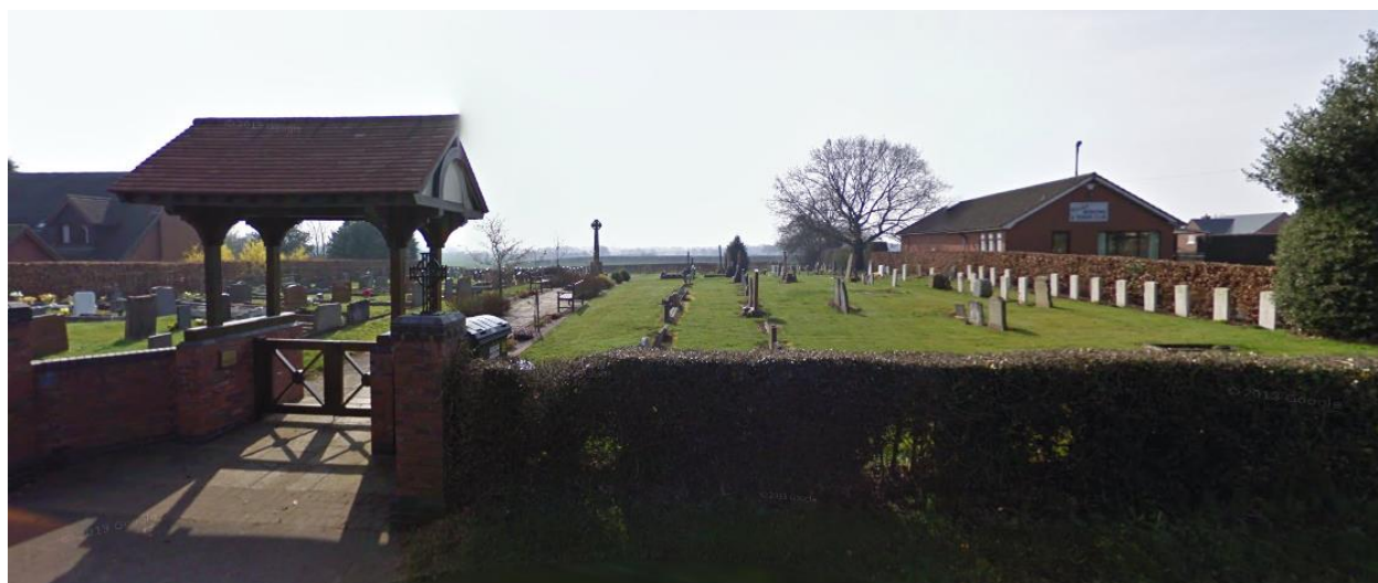
Christ Church Churchyard Extension, Tilstock, Shropshire