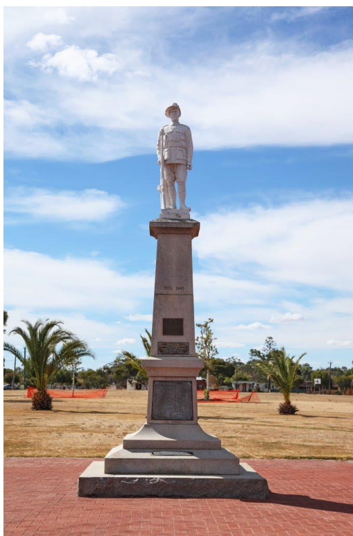
Katanning War Memorial